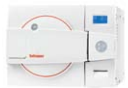
Pre & post vacuum tabletop sterilizers designed to perform class B cycles