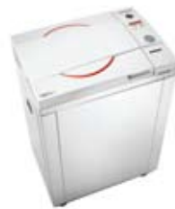
Laboratory autoclaves ranging in size and application