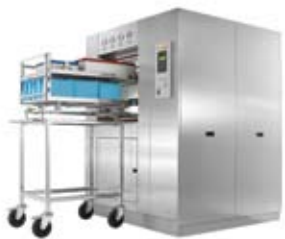
Large sterilizers for various industries and market needs

Featuring Tuttnauer's range of cleaning, disinfection and sterilization solutions