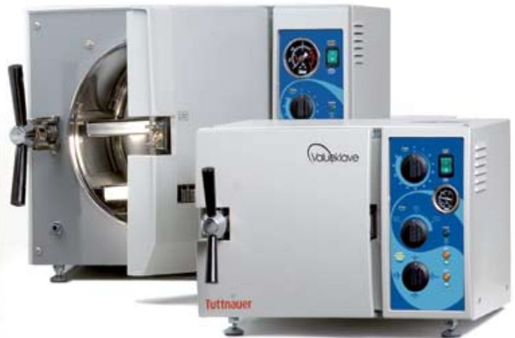
7.5 Liter Chamber Models

Complies with strict international directives and standards: