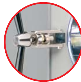
Double locking safety device

Complies with strict international directives and standards: