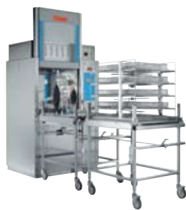
Washers/disinfectors for hospitals and laboratories