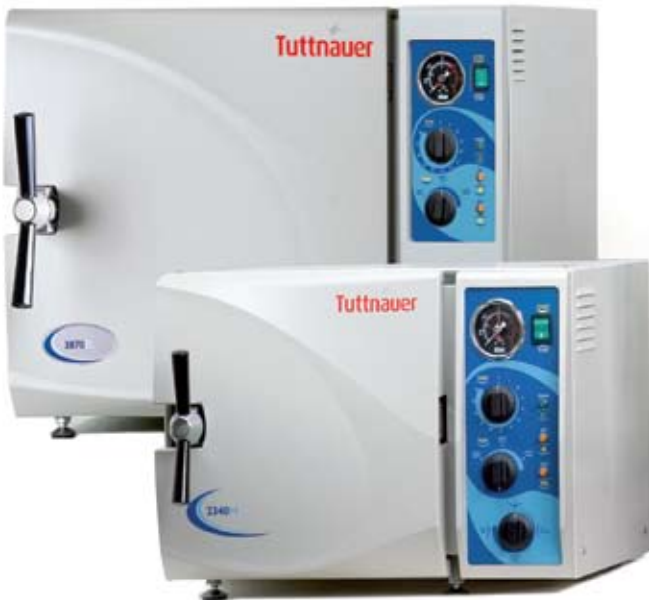
19/23 Liter Chamber Models